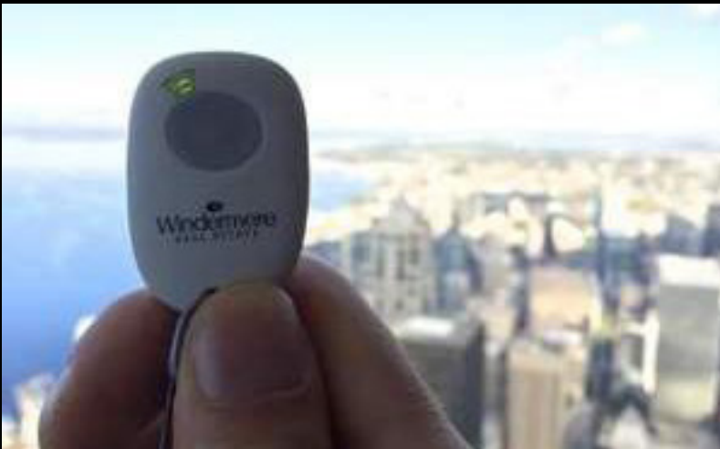
Pictured above: Custom branded Windermere solution

In recent years, there have been a number of high profile cases of violence against real estate agents. Due to the nature of their job, real estate professionals are required to spend extended periods of time alone with strangers in unfamiliar places. For many people, this can be a daunting and sometimes an unsafe environment. Due to unfortunate incidences, we know showing property is risky business. The NAR 2015 Member Safety Report reminds us of the need to remain vigilant. It asked members how safe they feel on the job, about their personal safety experiences and about the safety procedures and materials provided by their brokerage. Interestingly, the report found that while 96% of realtors have never been the victim of crime, 40% have found themselves in situations where they have feared for their safety.